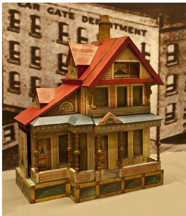
Large Bliss House. R. Bliss Manufacturing Co. ca early 1900s. Bliss Catalog No. 574. History Gallery.