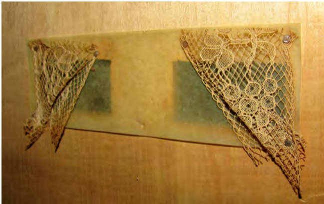
Bliss House (interior). R. Bliss Manufacturing Co. ca 1910. Bliss Catalog No. 573-F. History Gallery. Detail of original isinglass window pane. Isinglass is a natural transparent material made from the air bladders of sturgeons, which would not break like glass. Also pictured are the original lace curtains.

◆ Our museum currently has only one set of ABC Furniture on display.