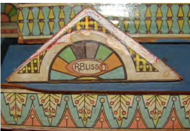
Large Bliss House. R. Bliss Manufacturing Co. ca early 1900s. Detail of Bliss marking above the main entry pediment. Bliss Catalog No. 574. History Gallery.

Once one of the most coveted objects of play, the dollhouse came gloriously marching into the homes of the middle class thanks to the Industrial Revolution. Mass-production made toys affordable, and children all across Europe and America would soon be found gazing longingly at the dog-eared pages of toy catalogs. In America, one of the most successful toy companies of its day was the R. Bliss Manufacturing Co., established in 1832, whose iconic dollhouses and toys have now become cherished pieces of museums and private collectors from all over the world. Here at The Mini Time Machine Museum, we are fortunate enough to have eight Bliss buildings in our collection – six houses, one stable, and one cabin – as well as two sets of Bliss ABC Furniture.