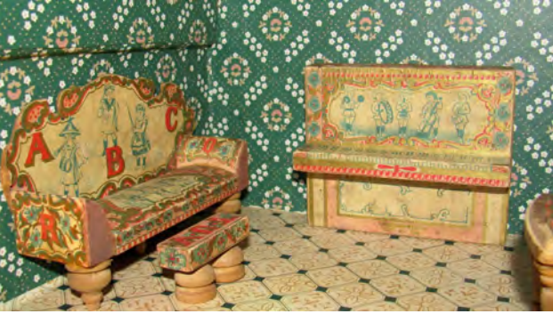
Large Bliss House (interior). R. Bliss Manufacturing Co. ca early 1900s. Bliss Catalog No. 574. History Gallery. Our Large Bliss House contains a set of Bliss ABC Furniture, of a smaller scale and with a different design than our larger-scale ABC Furniture set. They were added later and are not original to the house.