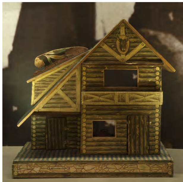
Bliss Adirondack Cabin . R. Bliss Manufacturing Co. ca 1910. History Gallery.

Emily Wolverton The Mini Time Machine Museum of Miniatures