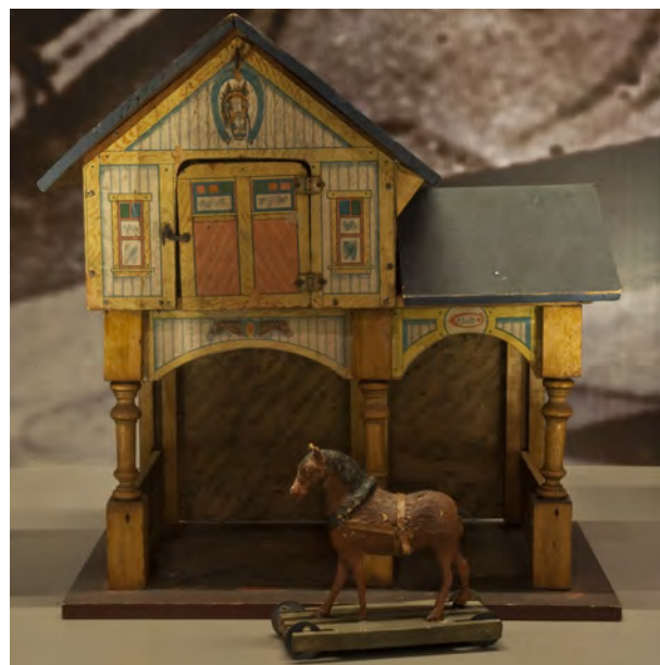
Bliss Stable . R. Bliss Manufacturing Co. ca early 1900s. History Gallery.