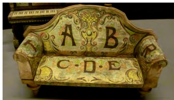
ABC Furniture . R. Bliss Manufacturing Co. ca 1910. History Gallery. Detail of the couch from Bliss Catalog No. 266.